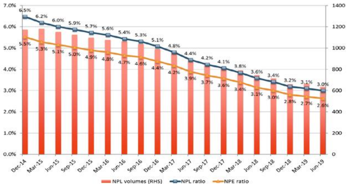
Quarterly trend in NPL and NPE ratios (%) and NPL volumes (€bn) — December 2014 to June 2019

But despite securitisation's pivotal role in the deleveraging of Europe's banks, there remains a dichotomy between what regulators demand of banks in terms of NPL reduction targets and what EU securitisation rules dictate: current securitisation legislation is making it difficult for potential issuers of NPL securitisations to comply – and a recent Opinion Piece from the EBA recommending various amendments to the Capital Requirements Regulation (CRR) as well as to the Securitisation Regulation underlined this. The ball now lies in the EC's court.